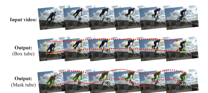
Figure 1. Given an unannotated video, our algorithm produces a set of spatio-temporal bounding box proposals and segmentation proposals that localize the foreground objects. Here we show one proposal (out of multiple) for each type.

Compared with static images, video provides rich spatiotemporal information that can greatly benefit learning algorithms. Object proposals are equally, if not more, needed in the video domain since the number of regions in a video is much larger than that of a single image. Furthermore, many video applications including summarization, activity recognition, and retrieval would benefit tremendously from a robust video object proposals method that can reduce the