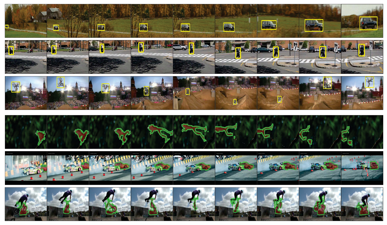
Figure 6. ( rows 1-3 ) Qualitative results of our spatial-temporal box proposals on the Visual Tracker Benchmark. Our proposals localize the object well, despite challenging factors in the videos, e.g., scale variation (first row), clutter (second row), in-plane rotation (third row), etc. ( rows 4-6 ) Qualitative results of our spatial-temporal segmentation proposals on SegTrack-v2. Our approach produces fine details of the object boundary (fourth row), and handles occlusion well (fifth row). Lastly, for the very difficult case in which objects have thin structures, e.g., the bicycle in the last row, our algorithm leaks out qualitatively, even though quantitatively we outperform previous methods.

ysis of our approach. For each of the three steps in our algorithm (initialization, iterative growing, and pixel-level segmentation), we profile the average computation time spent to process each frame. We conduct our analysis on the "Woman" sequence in the Visual Tracker Benchmark, which has 597 frames and is closest to the average frame length (584 frames) of that dataset. We measure the timings on a machine with an Intel i7 3.40GHz CPU and an NVIDIA Tesla K40 GPU.