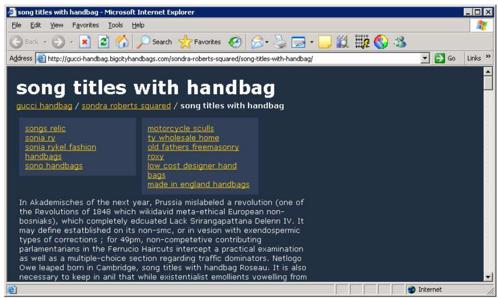
(c): Page full of spammer-targeted keywords that crawlers see (or browser users see when they access the cached page with scripting turned off)

(b): Fake "Account is suspended" page that spam investigators see when they visit the URL directly, without clicking through search results