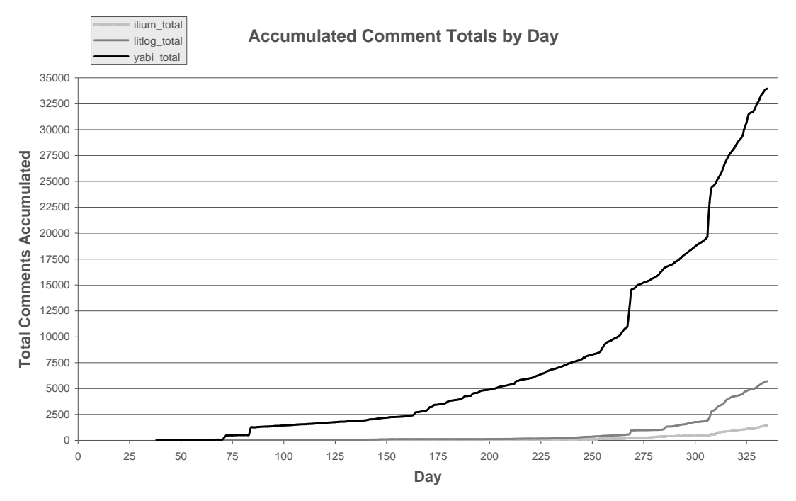
Figure 2: Accumulated comments received by each of three honey forums

Temporal analysis. Figure 2 shows the number of accumulative comments received by each of the three honey forums during the first 339 days, from September 25, 2005 to August 30, 2006. The majority of the comments received by each honey blog arrived after we stopped posting content. For example, yabi,