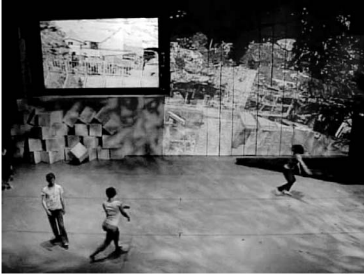
Figure 4: Dancers Marling, Mehling and Terrell-Carazo perform in front of T-LiDAR projections. (still from video)

The complexity arising from the varied elements provided both artistic and technical challenges. It was important to offer the audience a multisensory experience that did not overwhelm viewers with visual cacophony. Appropriate changes in pace ensured that all elements built on each other. Moments focused on individual elements enabled the audience to become familiar with that component. As the performance progressed, overlapping elements highlighted the chaos and confusion during collapse of a system.