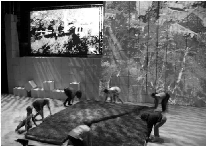
Figure 3: Performers reposition the three-piece island stage. T-LiDAR imagery fills the background. The 16' x 9' polarization-preserving projection screen is in the upper left-hand corner. The projection continues onto the stacks of boxes on the right and onto the floor.