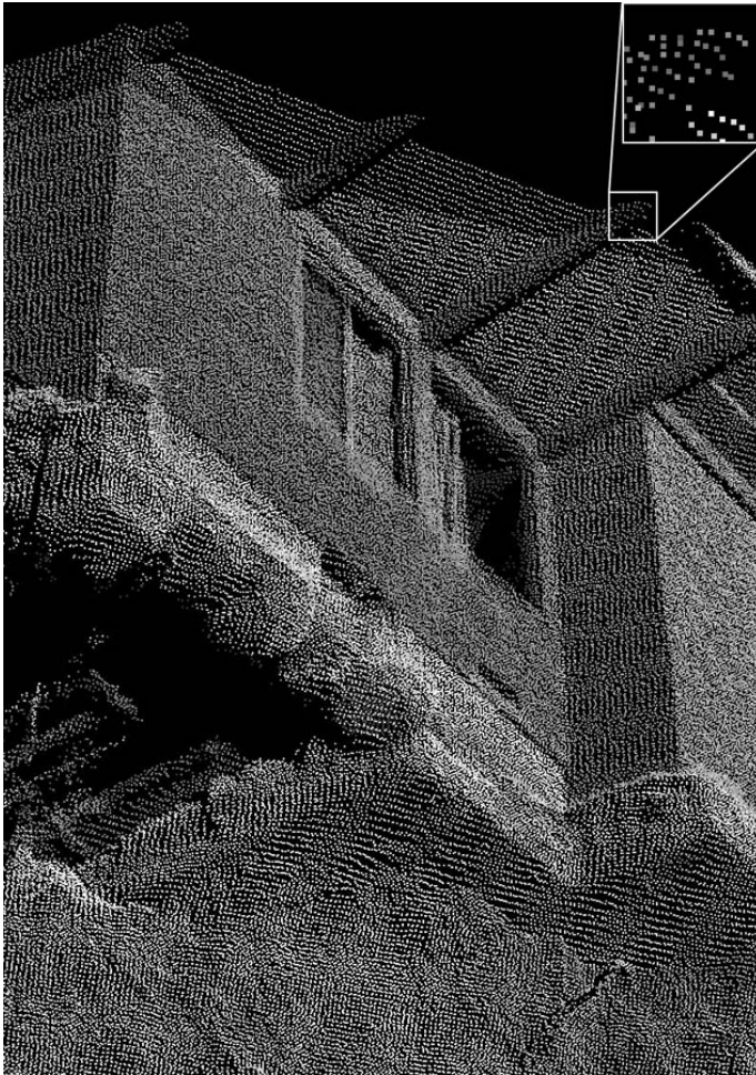
Figure 1: A T-LiDAR scan looking up through the floorboards of a house after a landslide removed part of its foundation. The inset shows a close-up of the placard-based visualization, revealing gaps between reflections.

dimensional pointilist image of the scanned landscape [7]. The best datasets for Collapse were collected for scientific study of natural hazards such as landslides by geophysicist Bawden, who joined the collaboration and made data available for performance.