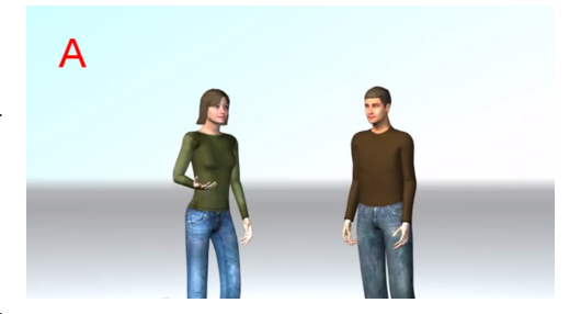
Fig. 4. A snapshot of the experimental stimuli.

Stimulus Construction We currently have 50 annotated story dialogs. In this experiment, we use four stories with different subject matter: protest, pet, storm and gardening, as illustrated in Fig. 1 and Fig. 5. Fig. 4 shows a screenshot of the stimuli. We use our own animation software to generate the stimuli based on the specified gesture script. This software uses motion captured data for the wrist path, hand shape and hand orienta-